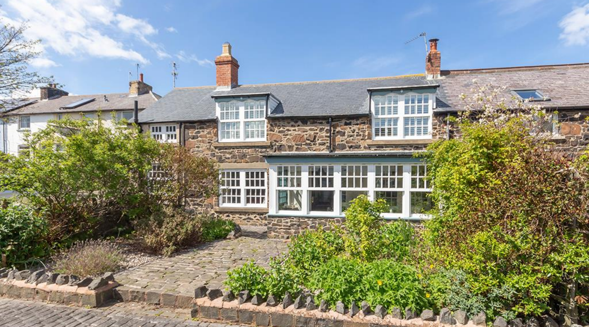
Whindow Cottage 11 Whin Hill Craster